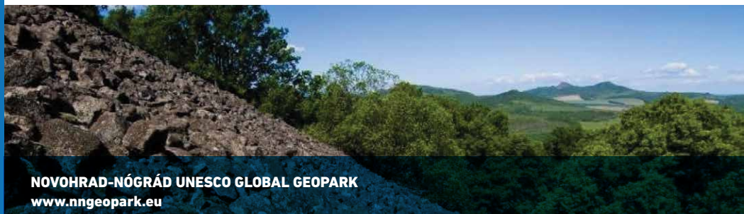
NOVOHRAD-NÓGRÁD UNESCO GLOBAL GEOPARK www.nngeopark.eu

Visitors to the geopark founded and maintained by Balaton Uplands National Park Directorate can rely on trained geotour guides and expect caving adventures in Csodabogyós Cave and Szentgáli-kőlik Cave. They can visit geological exhibition sites, like the western gate of the Geopark, Tapolca Lake Cave Visitor Centre, or Lavender House Visitor Centre in Tihany, also known as the eastern gate of the Geopark. Red sandstone study path in Alsóörs, Basalt Organs educational trail (Szent György Hill) depicting our volcanic heritage, Route of fire nature trail (Hegyesztű-Kopasz Hill), supplemented with the European Geoparks Week events all “animate” our lifeless natural values.