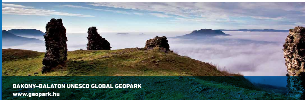
BAKONY-BALATON UNESCO GLOBAL GEOPARK www.geopark.hu

Our geoparks are endowed with an outstandingly spectacular and rich geological heritage, and local communities are also frequently involved in the activities to conserve and present these areas. The geological values, in combination with cultural heritage areas, offer attractive geotourism programs. 161 geoparks can take pride in being recognized as UNESCO Global Geoparks, including 81 in the European Geoparks Network.